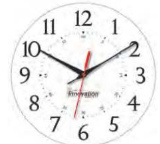
Standard Arabic 12/60 Part # SA60