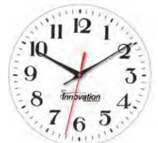
Classic Arabic Part # CA00