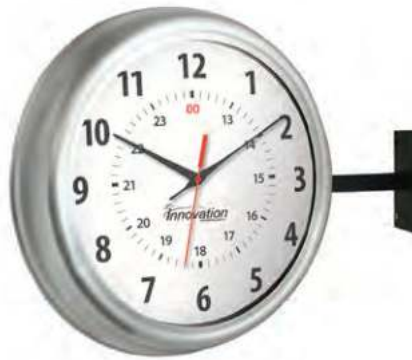
16" (40.64cm) Double Sided Wall Mount Part # 520026 - Battery