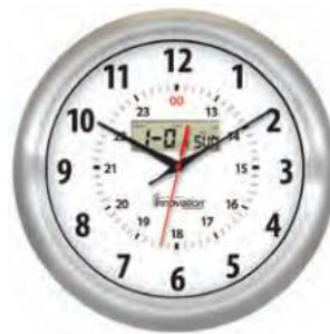
13" (33.02cm) Part # 510006L