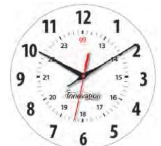
Standard Military 12/24 Part # SM24

Additional Custom Logo Designs Available