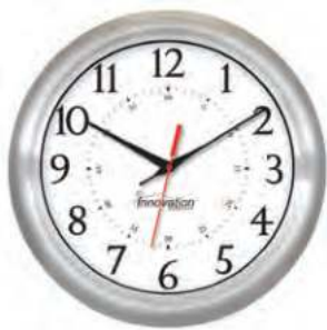
13" (33.02cm) shown above Part # 510016 - Battery